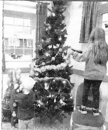
Small hands decorate the Victory Hall and its Christmas tree ready for the festive season.